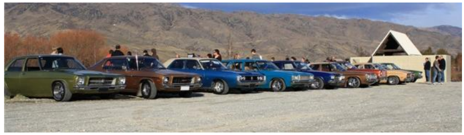
Some of last years crew lined up for a photo shoot at Lowburn.

We really need to know numbers for this one so please let us know if you will be attending and with how many passengers.