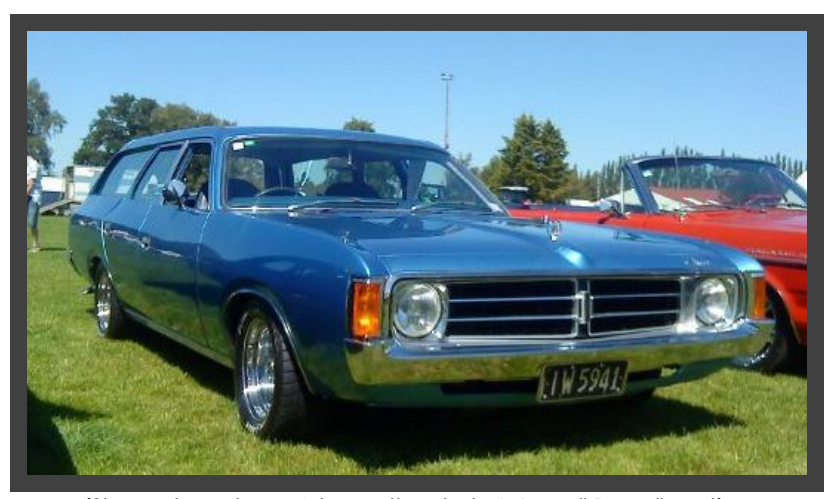
(Shameless plug – A huge thanks to Womall Panelbeating for getting the wagon looking so great!!)

Like to see your ride here? Then email us your favourite photo along with the above info... admin@southernaussiemuscle.co.nz