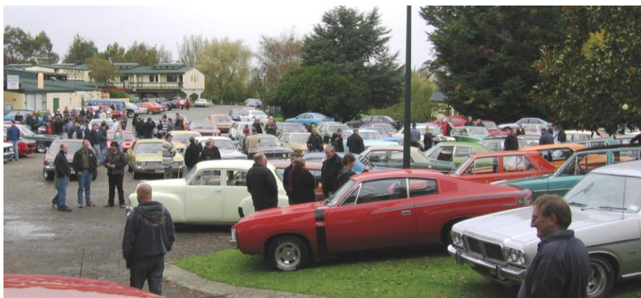
The first Southern Aussie Muscle event – 15 th April 2007!!

(Check out the poster on the last page...)