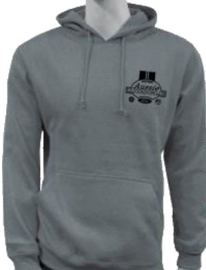
Black Hoodie (L, XL, XXL) (Logo Front – Website Back) $49.00