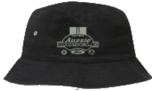
Adults Bucket Hat (6 available) (Logo Front) $21.00