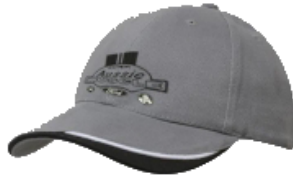
Adults Cap (2 available) (Logo Front) $19.00