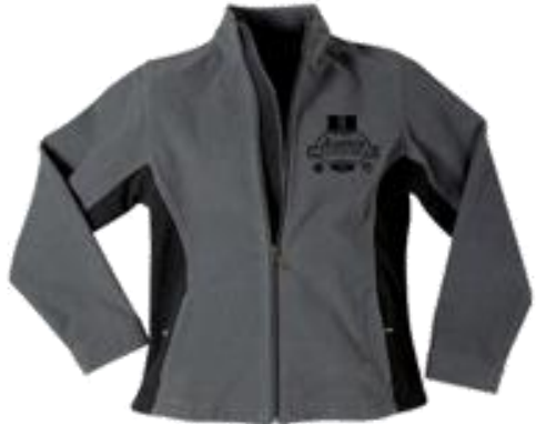
Micro Fleece Jacket (L) (Logo Front – Website Back) $87.00

All our other gear can be viewed on our website on the 'Club Gear' page or call into Southern Workwear, Mersey Street, Gore.