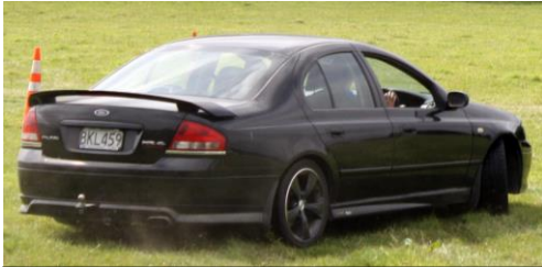
Callum Dickson, Gore Ford XR6 Turbo