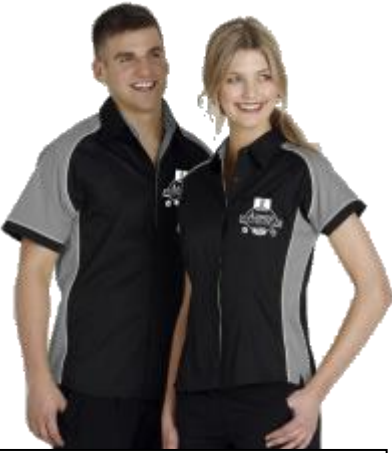
Mens Nitro Shirt (L, XL) Womens Nitro Shirt (12, 14) (Logo Front – Website Back) $59.00