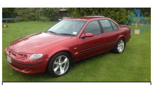
Gary Fisher, Gore Ford EL Falcon XR6