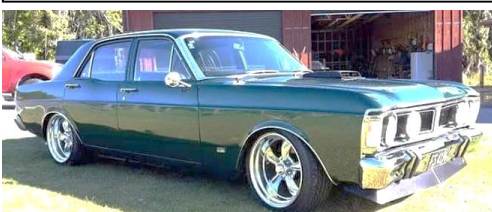
Culum & Shanla Rogers, Cromwell Ford XY Falcon