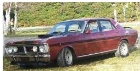
Daryl Moyles, Gore Ford XY Falcon