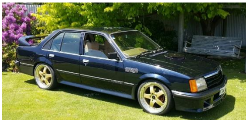
Stu Fletcher, Invercargill 1980 VB Commodore