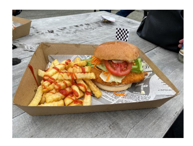
And a BIG thank you to the club for the paying for it \bigcirc

of the Balfour tavern for doing such an awesome job of our lunch.